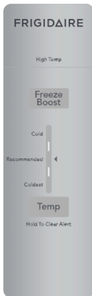
Sabbath Mode activated

Press and hold the Temp and Freeze Boost buttons simultaneously for 5 seconds. One LED on each side of Recommended setting will be lit while the unit is in Sabbath mode.